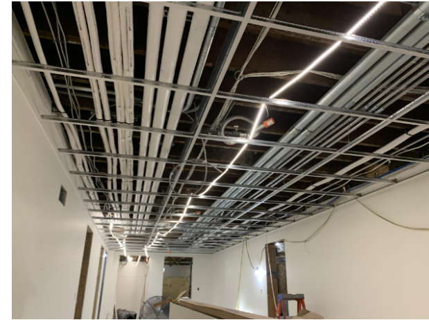
Installation of Ceiling Grid in Basement