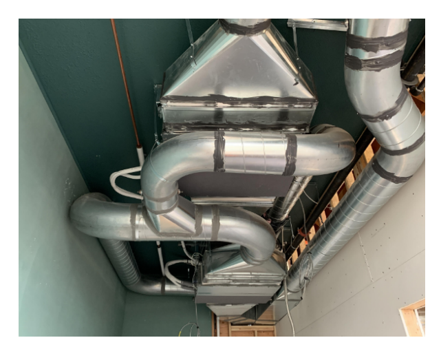
Level 1 HVAC Rought In and Drywall